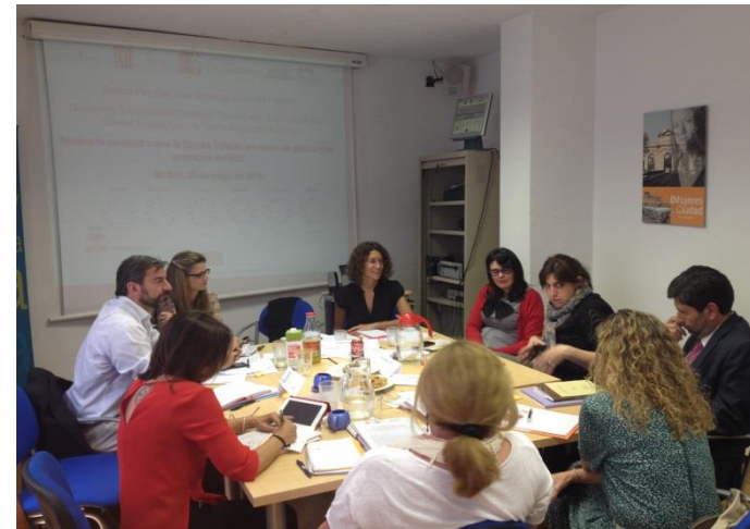
Women's Council of Madrid